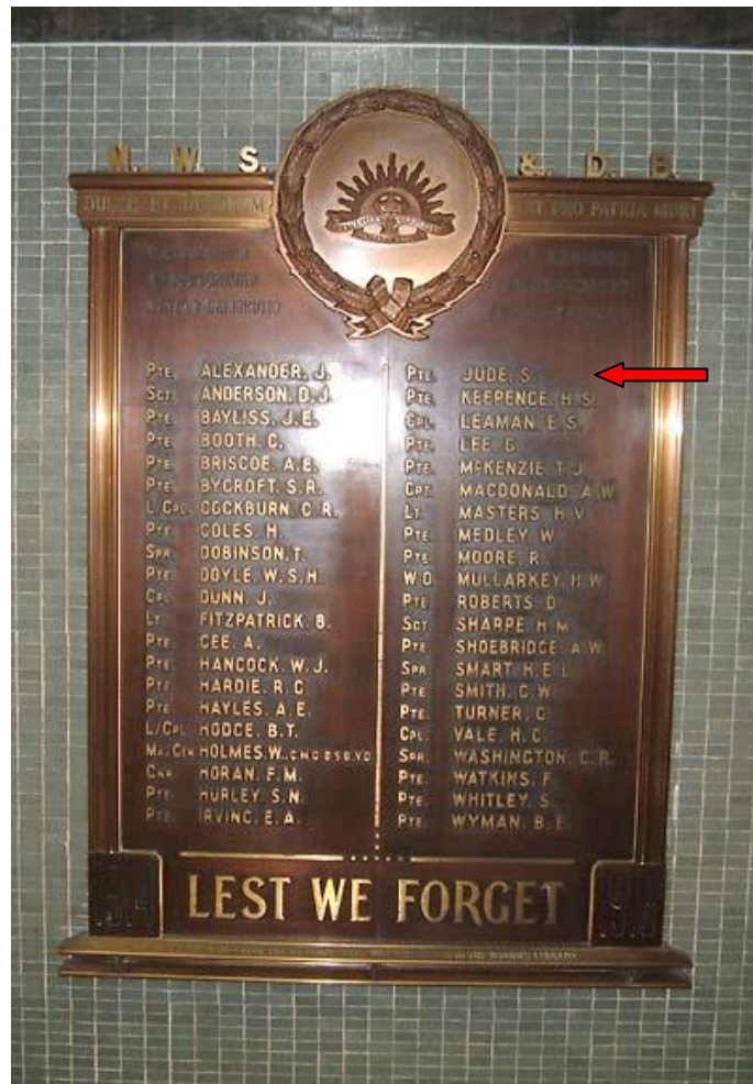
M.W.S. and D. B. Honour Board