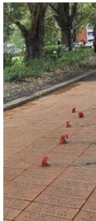
Honour Avenue War Memorial Fairfield