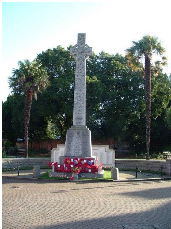
Wisbech War Memorial