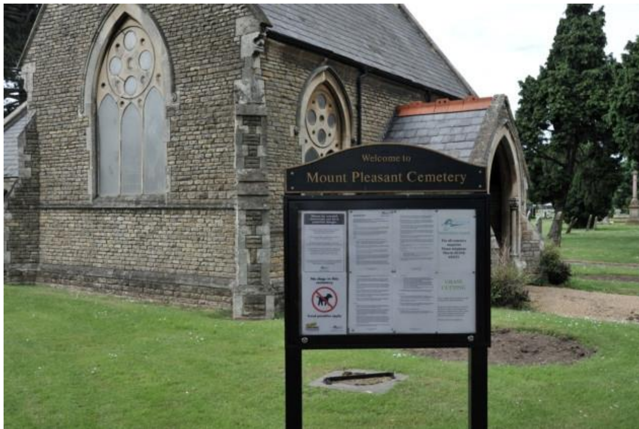
Mt. Pleasant Cemetery, Wisbech

Mt. Pleasant Cemetery, Wisbech contains 49 Commonwealth War Graves – 24 from World War 1 & 25 from World War 2.