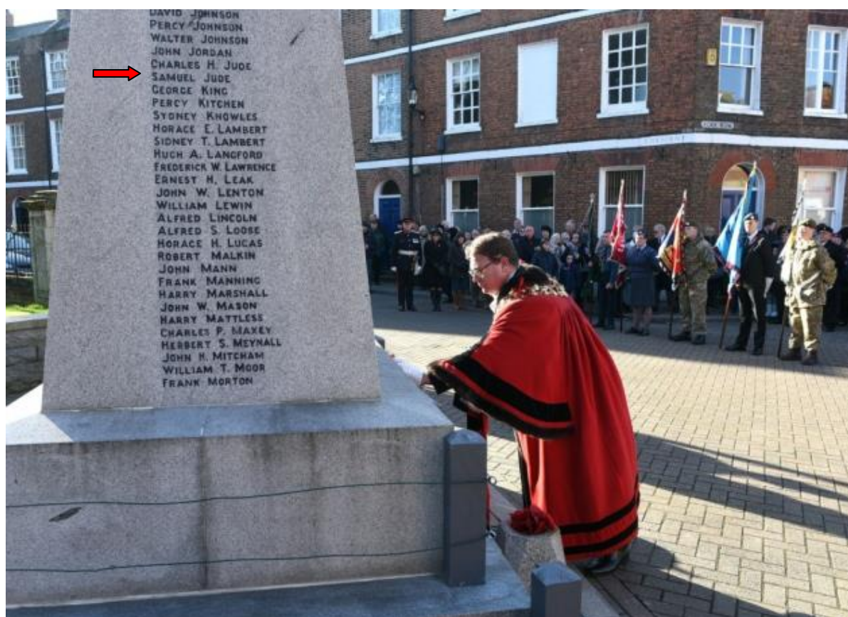
Remembrance Day, 2017